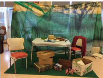
Set and prop pieces provided by the Beachwood Community Center for YOU CAN'T PLAY BALL IN A SKIRT!